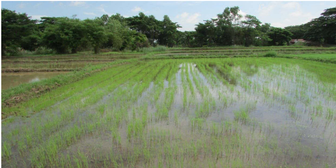
Rice crop sown with Gongli planter. The farmer would like closer rows, and less seed scatter.